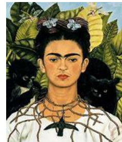
The necklace and humming bird' 1940