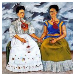
'The Two Fridas', 1939

She was famous for painting self-portraits (pictures of herself) but she was particularly famous for painting women as strong people.