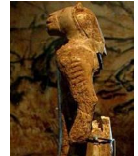
Image source: Lion-Human of Hohlenstein Stadel Close-up of upper half. (Lowenmensch) c.30,000 BCE Ulmer Museum, Ulm, Germany