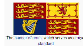
The banner of arms, which serves as a royal standard